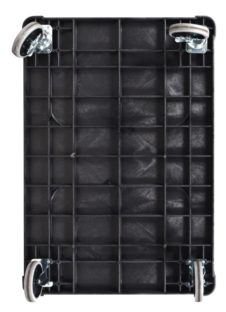
Reinforced ribbing is molded into both shelves for extra strength.