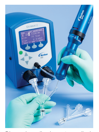
Dispensing adhesive onto medical components with HPx^{TM} tool.