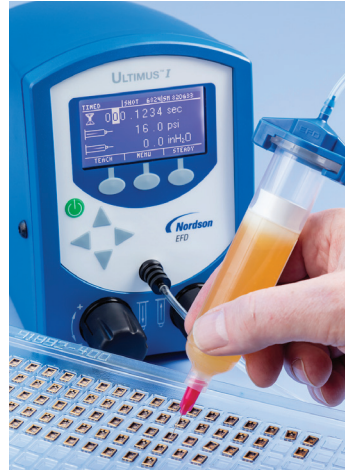
Dispensing flux onto electronic components.