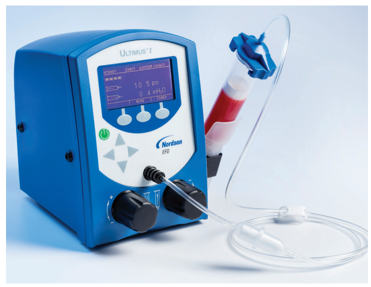
Ultimus dispensers bring exceptional process control to medical device, electronics, and other critical dispensing processes.

A higher level of simple, reliable benchtop fluid dispensing control